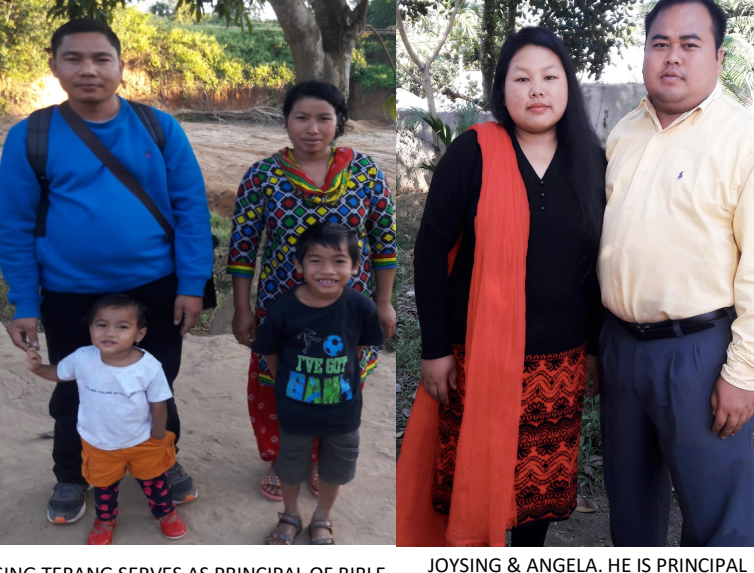
INSTITUTE IN NAGALAND, N.E. INDIA, 30 MEN & 8 WOMEN